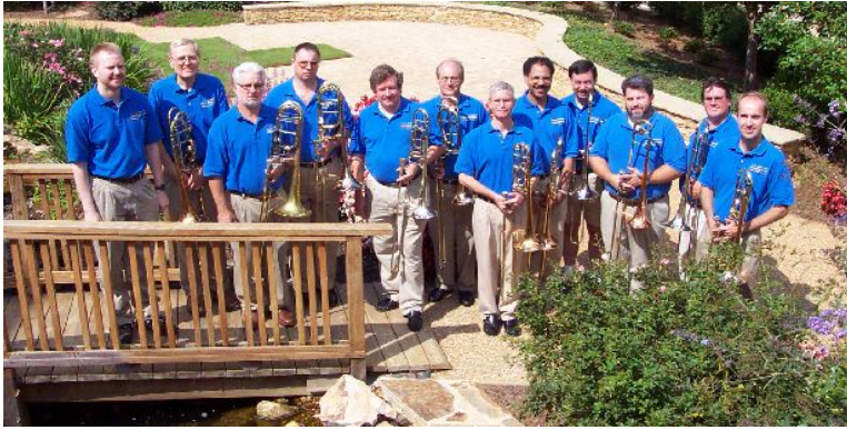
Slide by Slide

An Ensemble of trombones playing jazz and contemporary tunes with their powerful yet mellow sound will be joining us for Earth Day. The group performs throughout the year at various venues including churches, malls, festivals, etc. Slide by Slide has played with www.slidebyslide.org Available for Bookings.