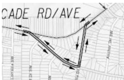
Boulevard Lorraine to Centra Villa Drive

TARGET CONSTRUCTION START: Spring 2022 – clearing, erosion control, utility relocations on eastern project limits (Delowe Drive to Avon Avenue)