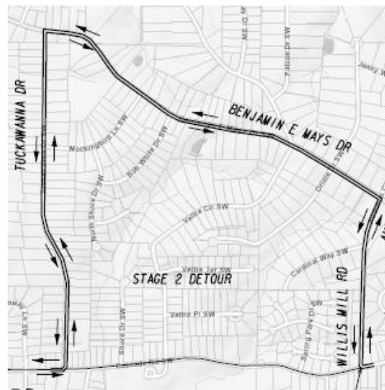
Tuckawwana Drive to Willis Mill Road