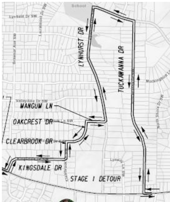
Kingsdale Drive to Tuckawwana Drive

Three (3) road closures with detours ( pictured below ) are proposed to accommodate roadway improvements throughout the project. They will be implemented separately during the appropriate stages of project construction. Traffic advisories notifying the community of impending closures and detours will be distributed to media, sent to the project update emailing list, and posted on the ATLDOT website and digital media sites prior to implementation.